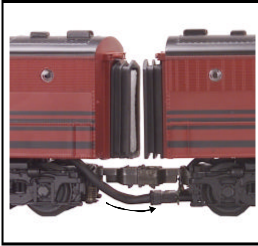
Figure 2: Connecting the Proto-Coupler extension

Before you operate your PA B Unit with the RailKing PA AA set see figure 2 for connecting the Proto-Coupler wiring harness.